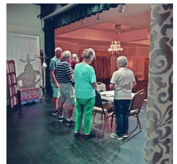
Rehearsal from back stage

Be sure to see it and tell your friends and neighbors to come too. Reservations forms are available in the Clubhouse lobby or pay at the door