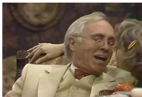
Jason Robards playing Grandpa in 1984.

https://video.search.yahoo.com/search/video;_ylt=A2KLfSEMp5FgWiEAYb9XNyoA;_ylu=Y29sbwNiZjEEcG9zAzIEdnRpZAMEc2VjA3Nj?p=You+Can%27t+Take+It+With+You+movie+images&fr=yymy-t-s#id=9&vid=2b37bca7787366df146ec02d3b69f82f&action=view