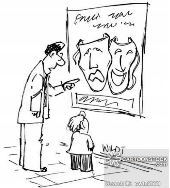
"The classic masks of Comedy and Tragedy, or as they're now known, emoticons."