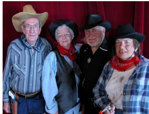
As Straight Shooting Sally in "Westward Whoa"