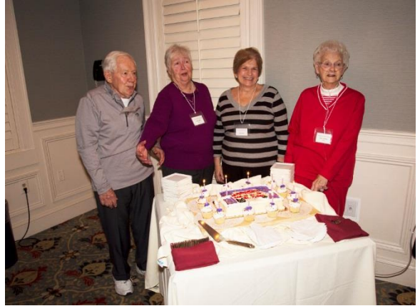
Four original founding members