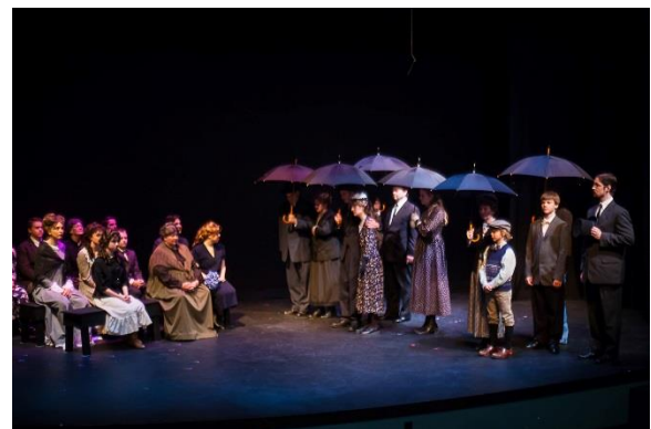
Cemetery scene from Our Town

Written by Stage Milk Team, March 14 th 2014